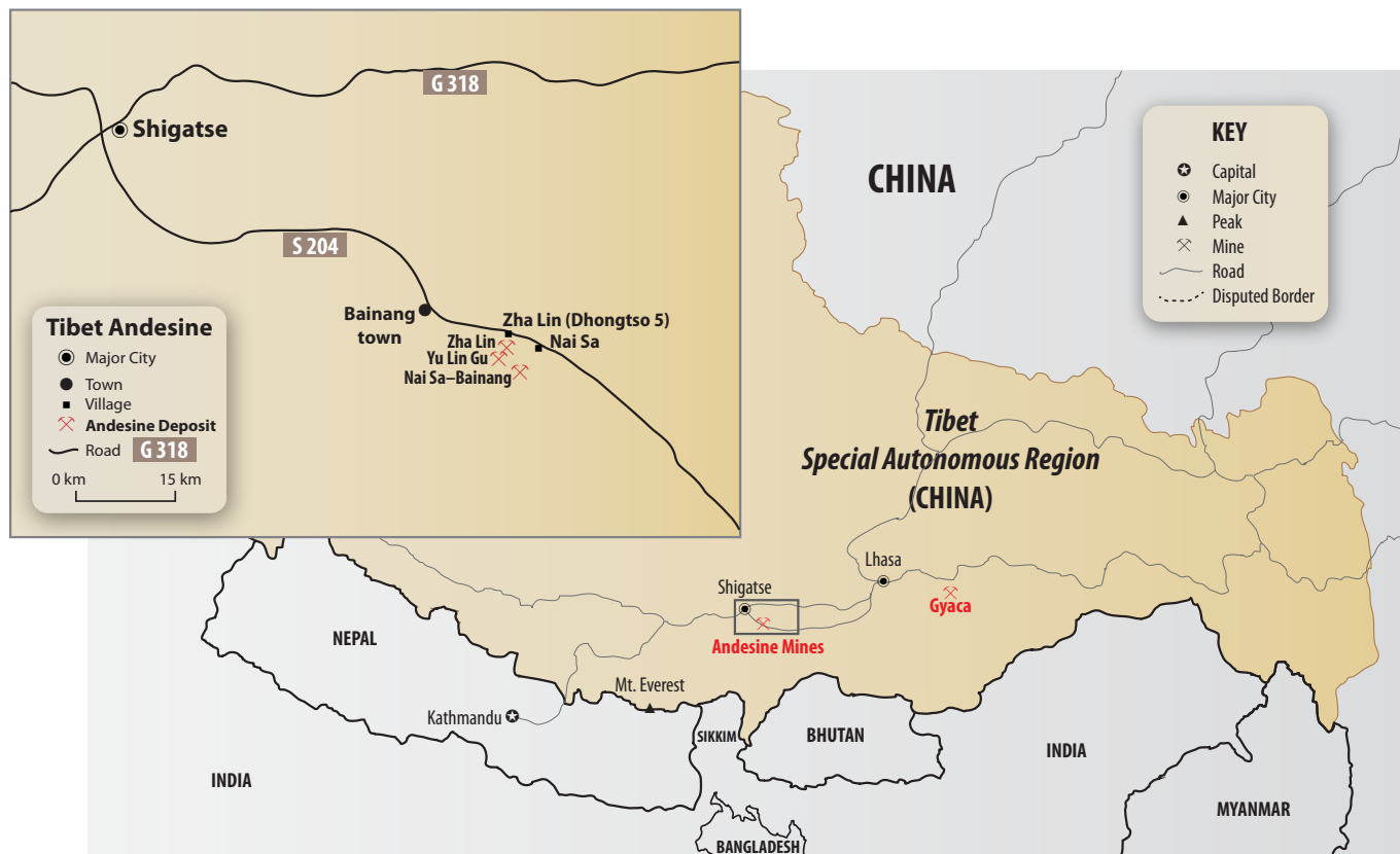
Figure 2. Map of Tibet showing the location of the Nai Sa-Bainang/Zha Lin/Yu Lin Gu andesine mines southeast of Shigatse, along with the Gyaca locality visited by Adolf Peretti in 2009. Map: R.W. Hughes; inset map after Abduriyim et al., 2011