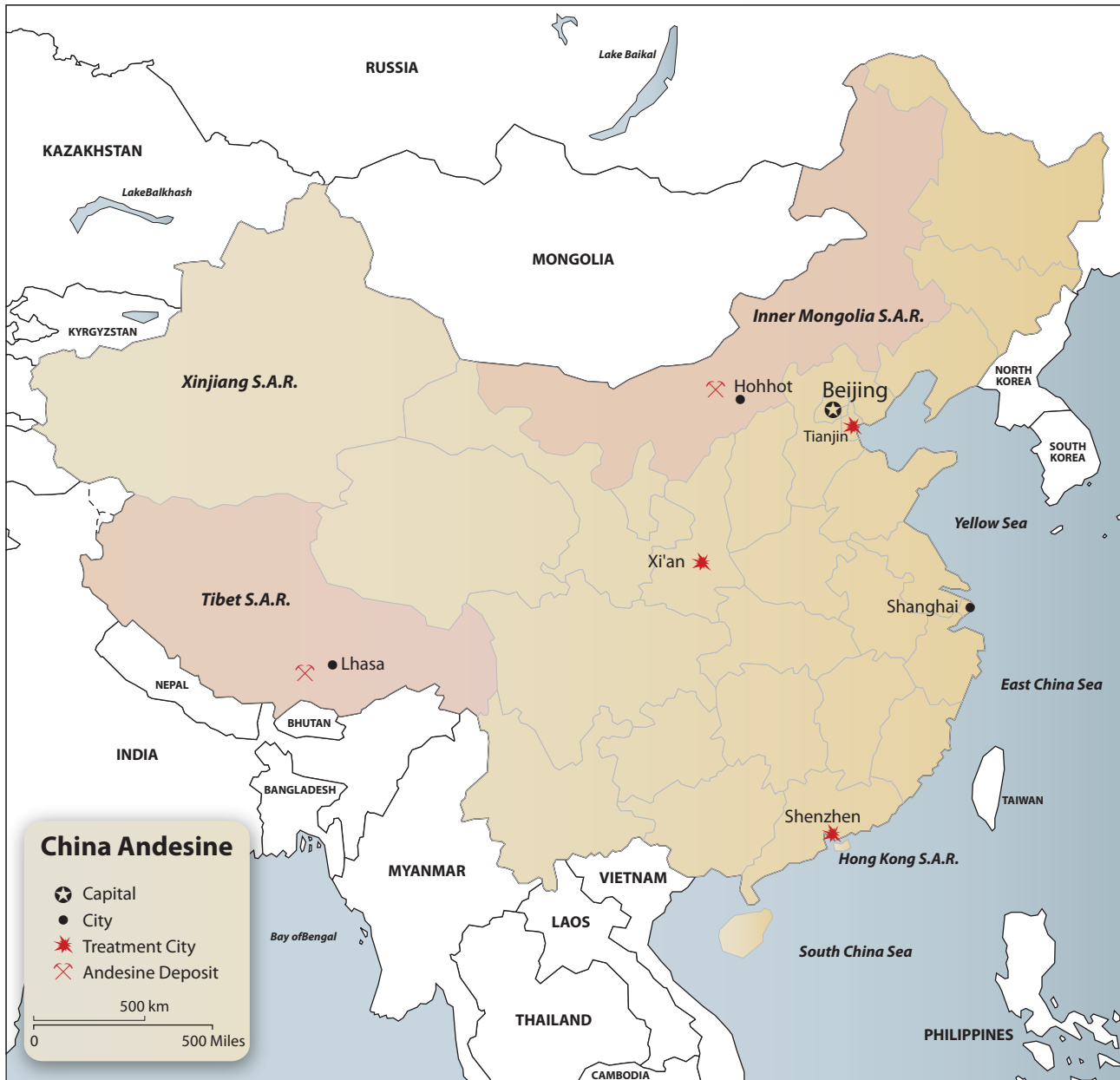
Figure 1. Map of China showing the location of the andesine mines in Tibet and Inner Mongolia, along with the locations of the major treatment centers. Map: R.W. Hughes